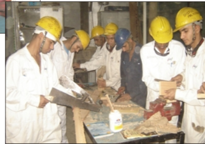
CARPENTRY WORKSHOP IN PROGRESS