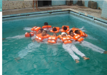
PST DRILL IN PROGRESS