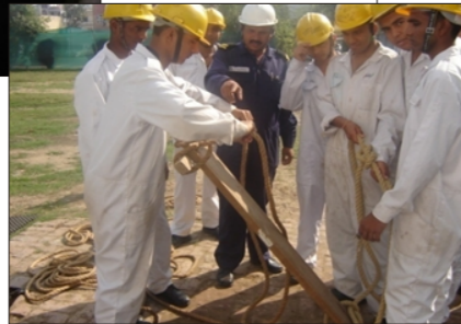
SEAMANSHIP CLASS IN PROGRESS