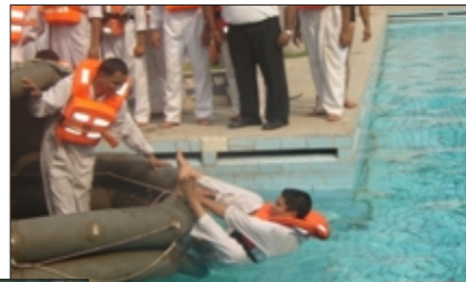
PST DRILL IN PROGRESS